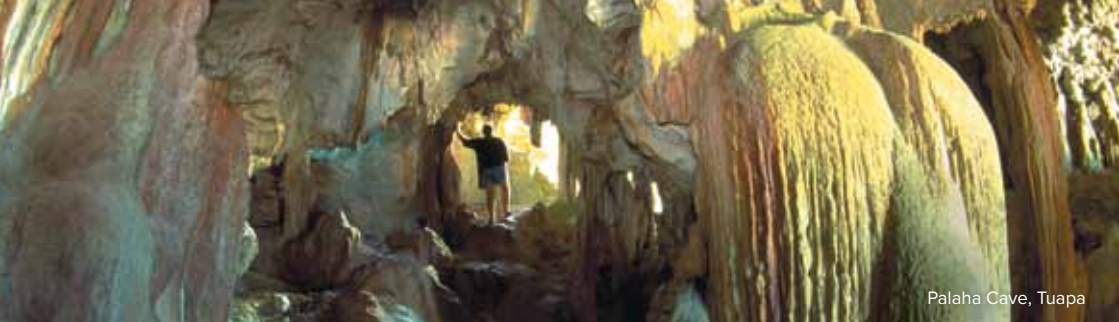
Palaha Cave, Tuapa