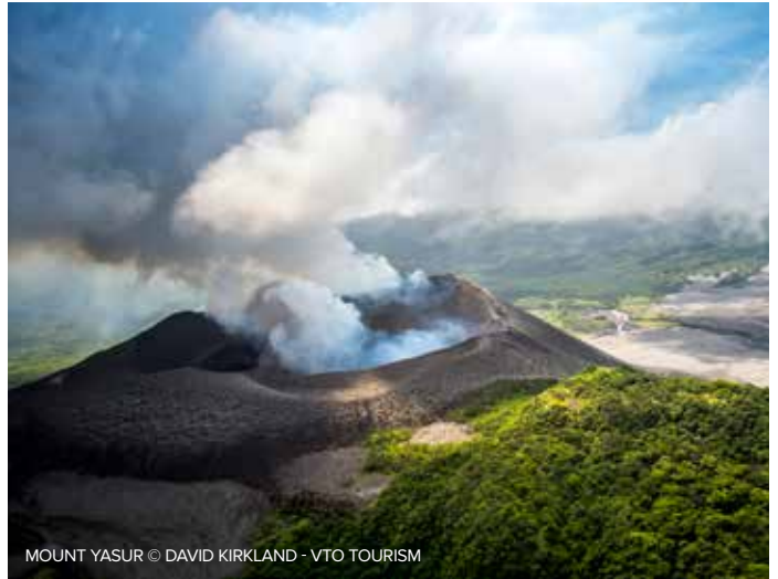
MOUNT YASUR

Bigger kids (and adults) will also love swimming in the spectacular waters of Tanna's Blue Cave. A hole in the roof of the cave lets the sun shine through, turning the water into a beautiful iridescent blue. If you have a Go Pro or waterproof phone or camera, make sure it's packed – this is the photo op of a lifetime! There is also more fun outside the caves, with jumping (into the water) platforms for those who love taking a leap.