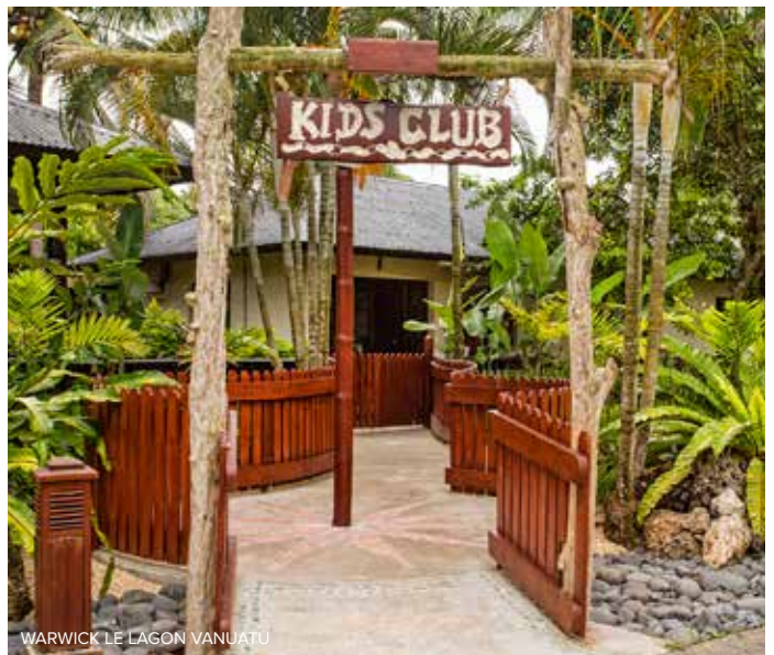
WARWICK LE LAGON VANUATU

You'll cross an 80 metre-high canyon, wobble across two suspension bridges and return high above a waterfall. Sound breathtaking? It most certainly is, and it's suitable for people of any age. Vanuatu Jungle Zipline has had clients as young as six and as old as 70. The crew will pick you up from any hotel in Port Vila and all you need to bring is some closed toe shoes or reef shoes, insect repellent, a camera, and clothing suitable to wear a harness over.