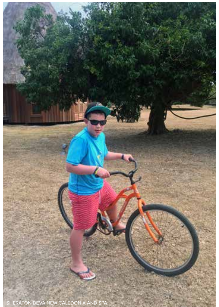
SHERATON DEVA NEW CALEDONIA AND SPA

The resort's pool is a winner. It's also a novelty for visiting kids to be around local French-speaking children. And like kids anywhere, they're quick to make new friends. To top it all off, Sheraton Deva also has a fantastic Kids Club. Free for resort guests, the centre is open seven days a week from around 7am to 5pm. It's a clean, well-designed space with loads of playthings.