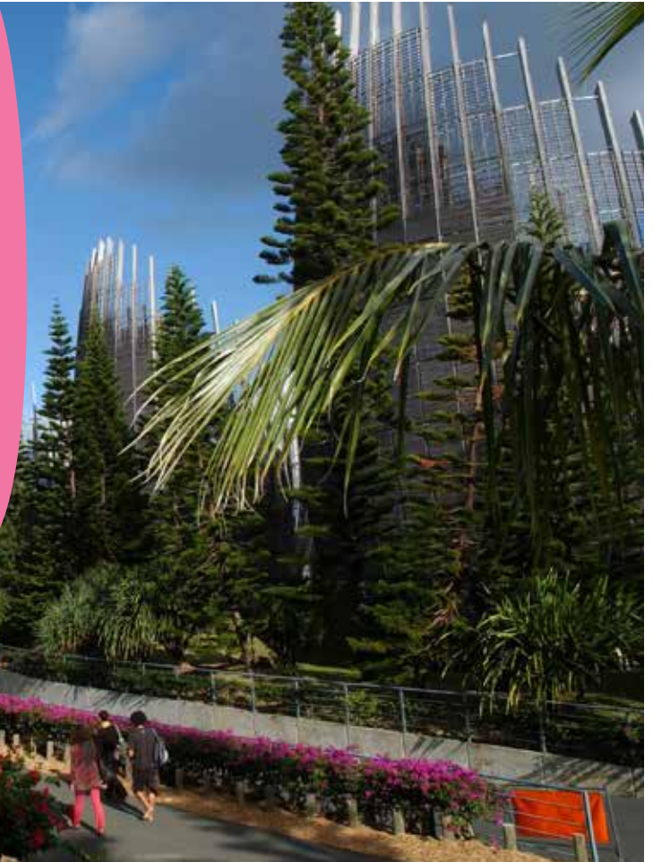
TJIBAOU CULTURAL CENTRE

The Kanaks have a long association with the arts, and the Tjibaou Cultural Centre, located along a ridge line on a peninsula about eight kilometres northeast of Nouméa, also makes for an interesting family visit. Designed to promote the heritage of the Kanak people, the complex contains 10 pavilions based on original indigenous design. It's architecturally impressive and includes an art centre, exhibition spaces, multi-media library and a landscaped park that the whole family can enjoy.