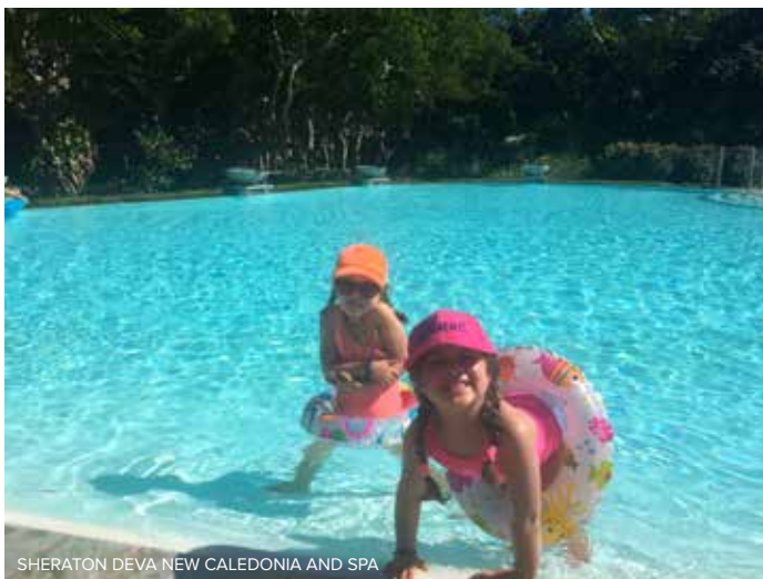
SHERATON DEVA NEW CALEDONIA AND SPA