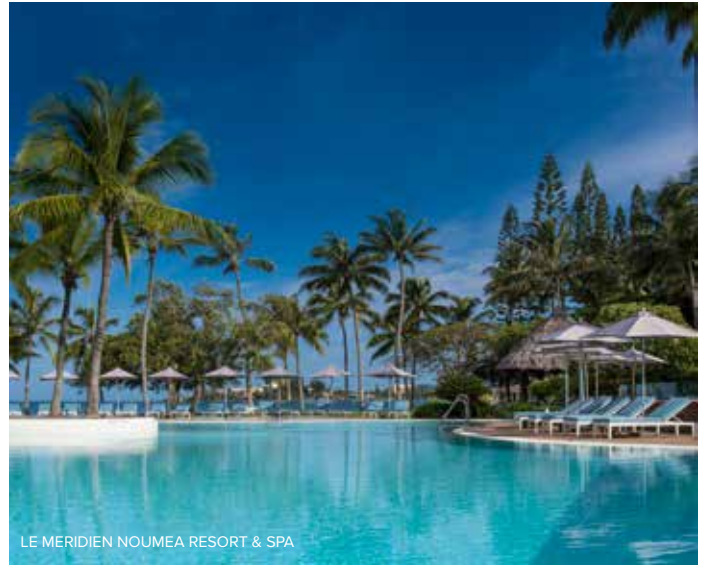
LE MERIDIEN NOUMEA RESORT & SPA

At almost 60 metres in height, the structure towers over the island and for those feeling brave, it's still possible to climb the 247 steps to the top. A day package includes transfers and a buffet lunch, and there is also the possibility of paddleboarding, snorkelling some pristine reefs, or simply chilling on the island's stunning white sand beaches. What's not to like.