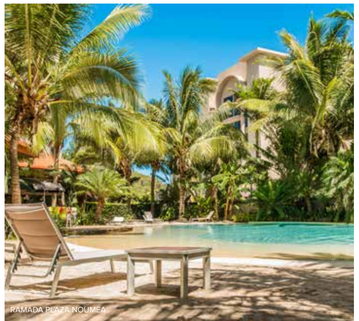
RAMADA PLAZA NOUMEA