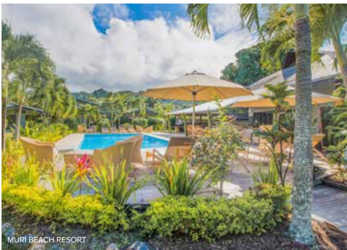
MURI BEACH RESORT