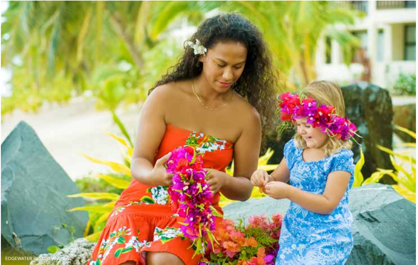
EDGEWATER RESORT AND SPA