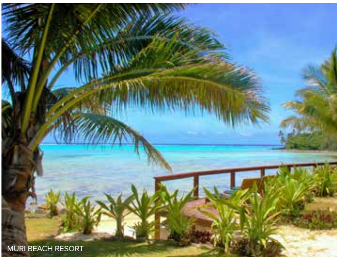
MURI BEACH RESORT