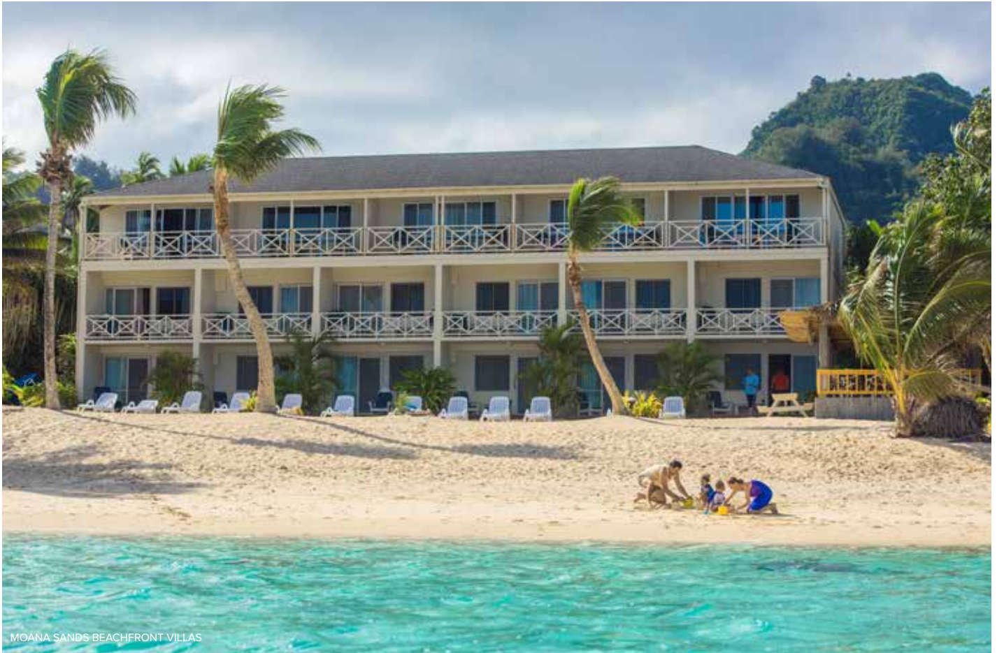
MOANA SANDS BEACHFRONT VILLAS