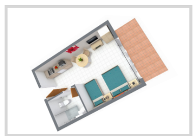
Room Size: 40 sqm / 431 sq ft Maximum occupancy: 3 people (2 adults & 1 child up to 12 years) Bedding: 1 × Split King & 1 × Single