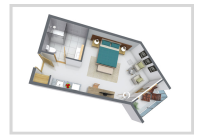
Room Size: 46 sqm / 495 sq ft Maximum occupancy: 2 people Bedding: I × Split King