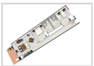
Room Size: 98 sqm / 1055 sq ft Maximum occupancy: 4 people (4 adults or 2 children up to 12 years) Bedding: 2 x Split King