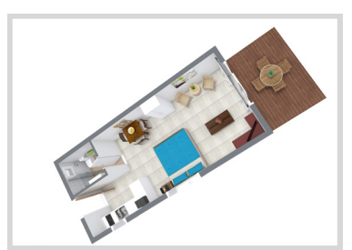
Room Size: 55 sqm / 592 sq ft Maximum occupancy: 2 people