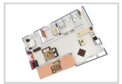
Room Size: 95 sqm / 1023 sq ft Maximum occupancy: 4 people (4 adults or 2 children up to 12 years) Bedding: 2 x Split King