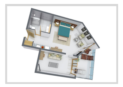
Room Size: 55 sqm / 592 sq ft Maximum occupancy: 2 people Bedding: I × Split King