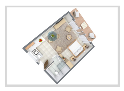
Room Size: 49 sqm / 527 sq ft Maximum occupancy: 2 people Bedding: I × Split King